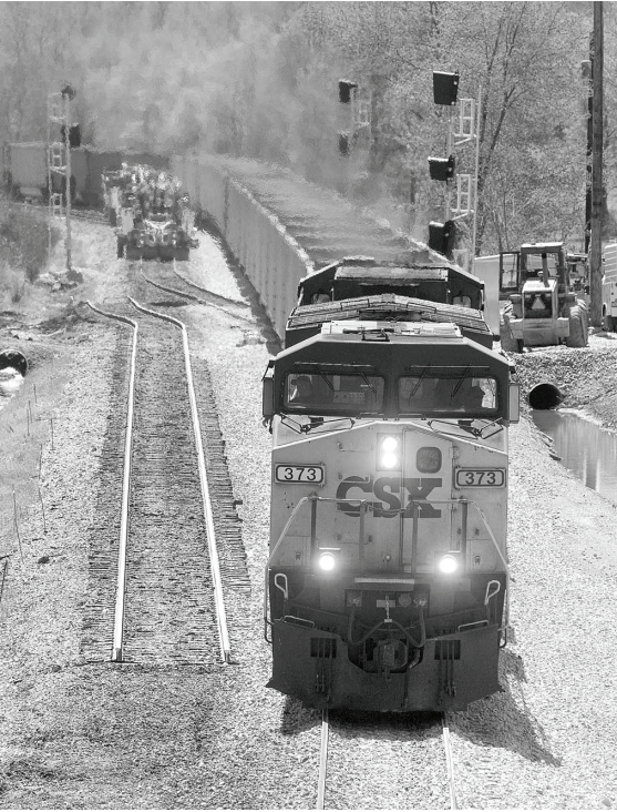
The first regular freight makes its way through the north side of the new Romney siding on April 9, 2007, soon after CSX MOW crews tied the North and South switches into the new siding .