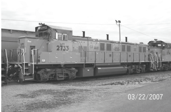
Three UP Genset-3s await their crew in a northbound consist at Fulton Yard. (Jim Futrell)