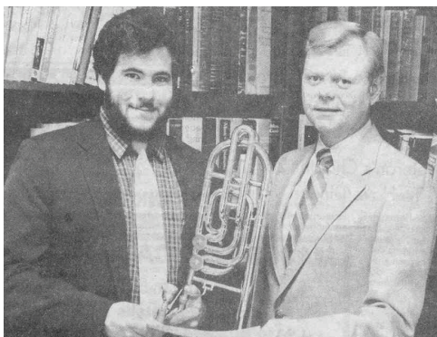
Can you identify the man on the left in 1986? Let's have more of these!

National Office Address Change- Due to increased mail volume, National is receiving mail exclusively at the following street address: National Railway Historical Society, 100 North 17th Street, STE 1203, Philadelphia, PA 19103-2783.