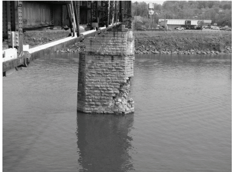
Damaged bridge pier on RJ Corman's Memphis Line at Clarksville, TN. Repairs are underway.